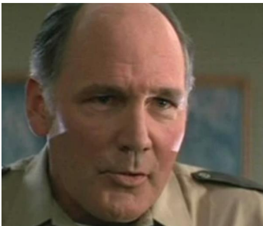
WoodsBoro děje. Nadřízený Deweyho.